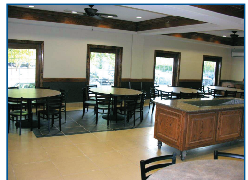
North view of the renovated and enlarged dining room with window extensions.