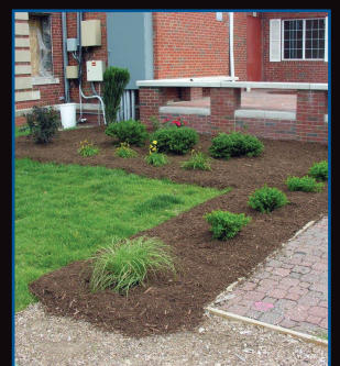
Landscaping accents the new brick patio outside the extended dining room.