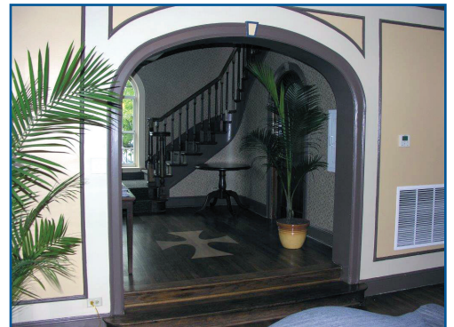
Renovated foyer featuring an inlaid cross in the flooring, new stairwell, and entry to the housemother's quarters.