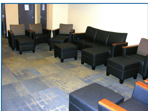
New basement TV room constructed in an area of the old-wing furnace room.