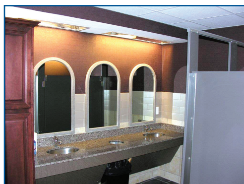
Renovated first-floor ladies' room.