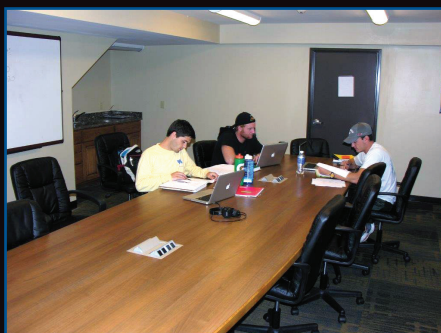
New conference room/study hall built in the old pit area in the basement.