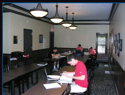
Renovated first-floor study hall.