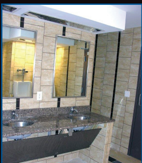
Renovation design used in the second- and third-floor bathrooms.