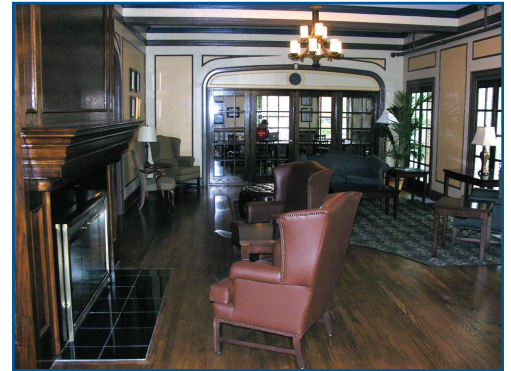
South view of the renovated living room looking into the opened entry to the first-floor study hall.

Renovation Campaign Chairman (913) 262-0762 jode12@hotmail.com