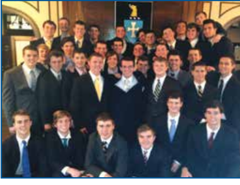
The fall 2013 initiation class.