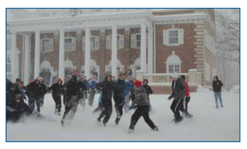
Members celebrate a snow day at Mizzou with a game of football on the front lawn.