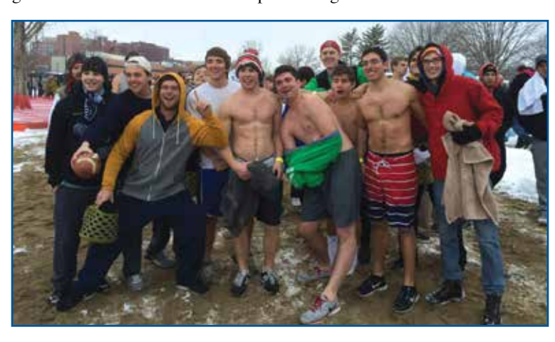
Sigma Chi was once again the leading donator at Columbia's annual Polar Plunge, where members volunteer to jump in the frigid waters at Stephen's College Lake, raising $7,000.